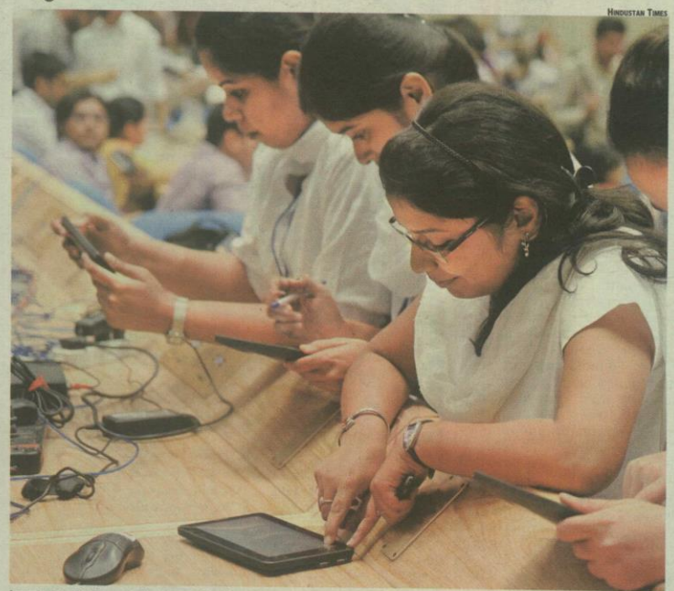
Learning initiatives: Aakash was developed as part of the country's programme of linking 25,000 colleges and 400 universities in an e-learning programme. The cost of the basic version fo

Moona confirmed that the ministry is looking at a ₹500