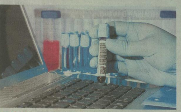
Any takers? Very few patents in India are commercially absorbed

Technology transfer is a time-tested mechanism and has created sustainability and entrepreneurial energy around universities and academic labs, so why shouldn't we go for it? If less than 100 universities in the US can create greater than $36 billion in product sales,